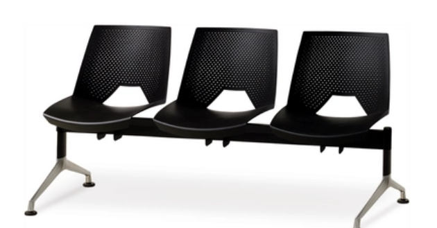
THE PHOTO MAY INCLUDE OPTIONAL